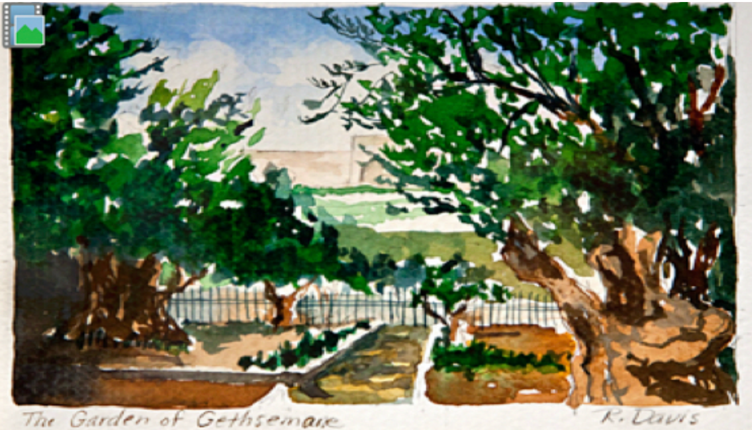
The Garden of Gethsemane