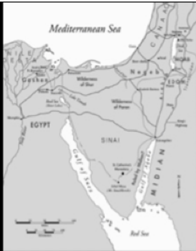
Geographical Setting of the Exodus --- Traditional trade route — Major trade and trade routes